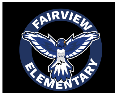
Placement of logo on backgrounds that impact visibility